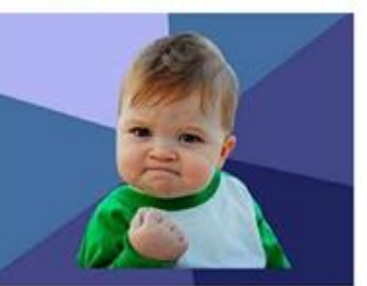
me after taking the take home test